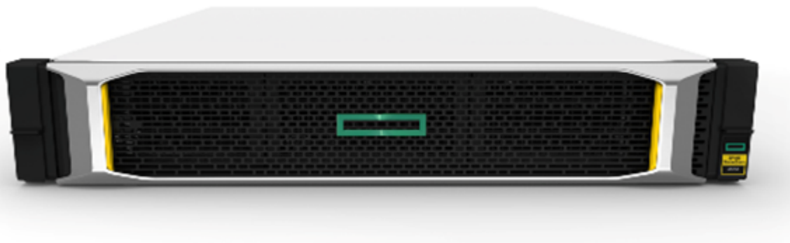
HPE MSA 2052 SAN Storage

Start small and scale as needed with any combination of SSD, Enterprise or Midline SAS drives