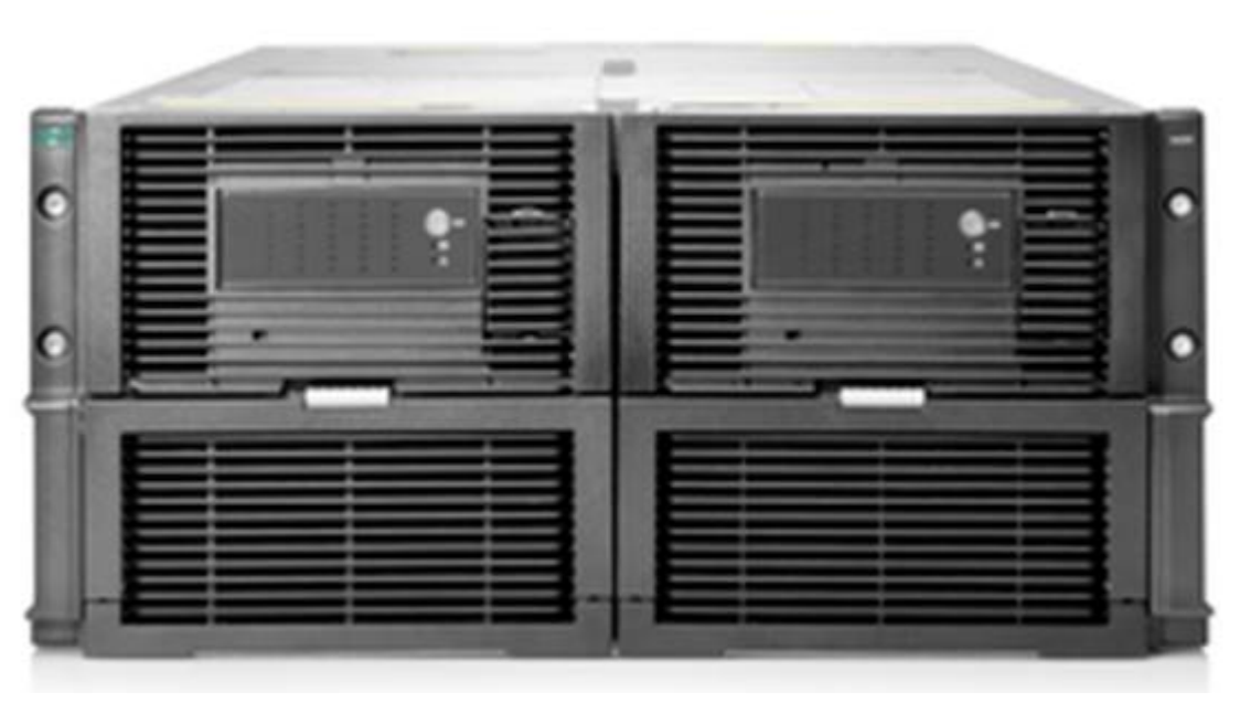
HPE D6020 Disk Enclosure -Front View

The HPE Apollo A4520 supports six (6) D6020 enclosures per A4520 (3 per node).