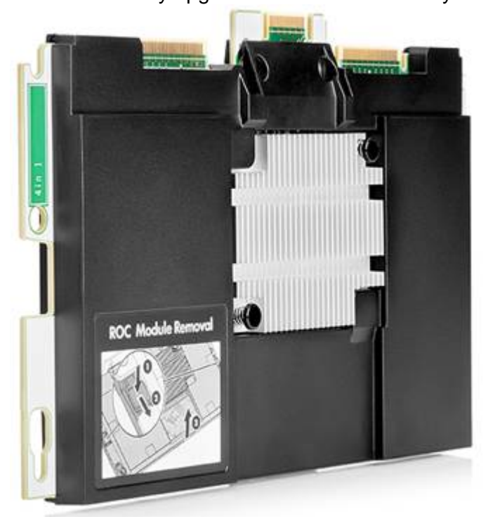
HPE Smart Array P240nr Controller

The HPE Smart Array P240nr Controller is a flexible Smart Array 12 Gb/s Serial Attached SCSI (SAS), PCI Express (PCIe) 3.0 RAID controller that provides enterprise-class storage performance and data protection for the HPE Synergy Compute Modules. It features four internal physical links and delivers increased compute module uptime by providing advanced storage functionality; including 1 GB Flash-Backed Write Cache (FBWC), pre-failure alert, and optional Secure Encryption. Data compatibility between HPE Smart Array Controllers means customers can easily upgrade to future Smart Array Controllers.