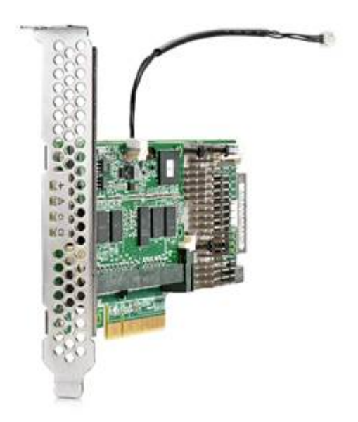
HPE Smart Array P440 Controller

The Gen9 family of controllers supports the HPE Smart Storage Battery. With HPE Smart Storage Battery, multiple Smart Array controllers are supported without needing additional backup power sources for each controller, resulting in simple upgrade process.