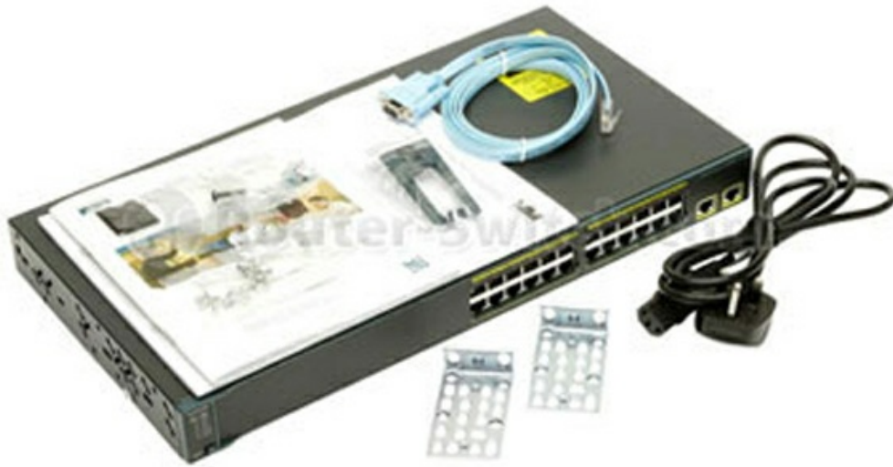
Table 1 shows the Quick Spec of the Cisco 2960-24TT-L switch.

Figure 1 shows the appearance of the Cisco WS-C2960-24TT-L switch and its accessories.