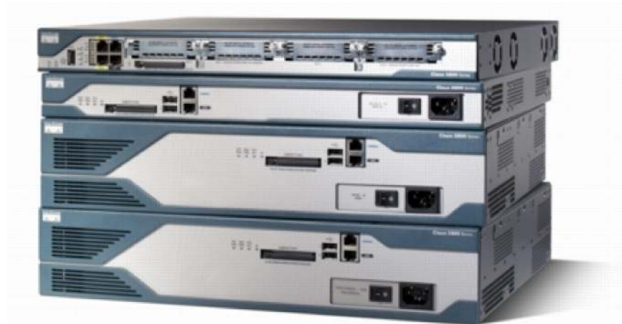
Figure 1. Cisco 2800 Series

Cisco Systems ® , Inc. is redefining best-in-class enterprise and small- to- midsize business routing with a new line of integrated services routers that are optimized for the secure, wire-speed delivery of concurrent data, voice, video, and wireless services. Founded on 20 years of leadership and innovation, the Cisco ® 2800 Series of integrated services routers (refer to Figure 1) intelligently embed data, security, voice, and wireless services into a single, resilient system for fast, scalable delivery of mission-critical business applications. The unique integrated systems architecture of the Cisco 2800 Series delivers maximum business agility and investment protection.