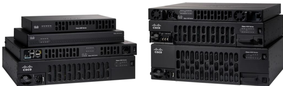
Figure 1. Cisco 4000 Series Integrated Services Routers

ISR4461, 4451, 4431, 4351, 4331, 4331-DC, 4321, 4221 & 4221X.